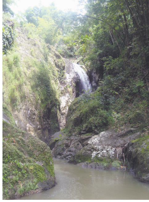
The Highland Falls

Our driver, Fabio, braked quickly as the jeep tore around a steep corner – the ribbon of the road ahead was completely blocked by a fallen tree. Fabio and Dennis from the second jeep didn't hesitate as